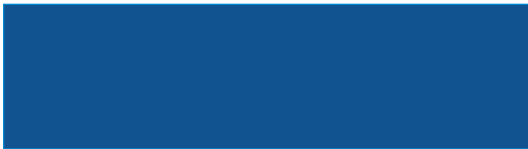
U-PSPro17SNSB2 BLUE RAL 5017